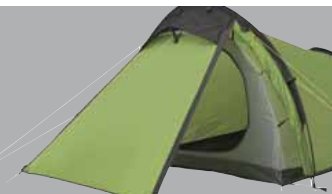
Double side door opening