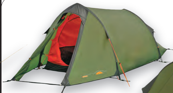
PINE/Black 200 TEXNITROP45151