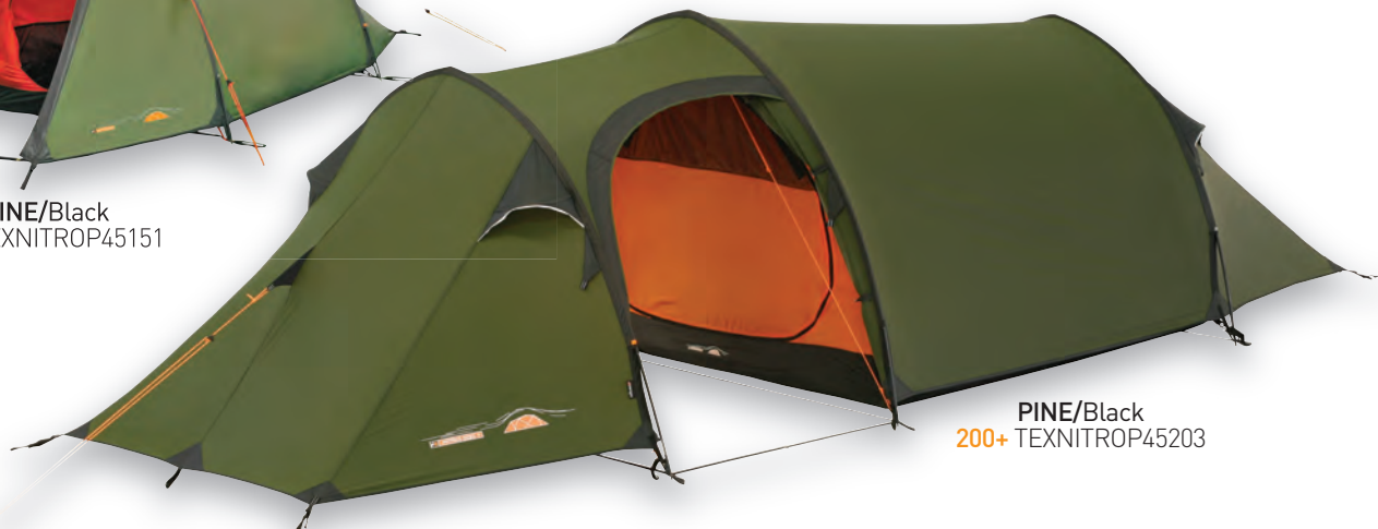
PINE/Black 200+ TEXNITROP45203

Fabrics: Flysheet: Protex® 20D SPU 5000 ripstop nylon Inner: Lightweight 40D ripstop nylon Groundsheet: HD nylon 6000