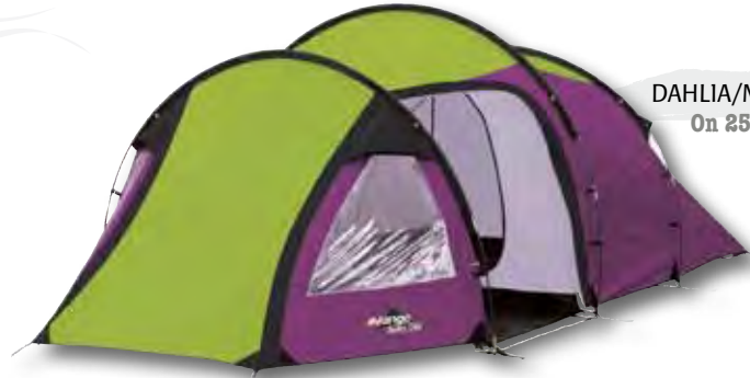
DAHLIA/Macaw On 250 only