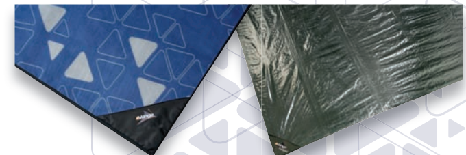
Carpet Covers living area of tent Blue TEFCARPET T9K181 Green TEFCARPET T9L181