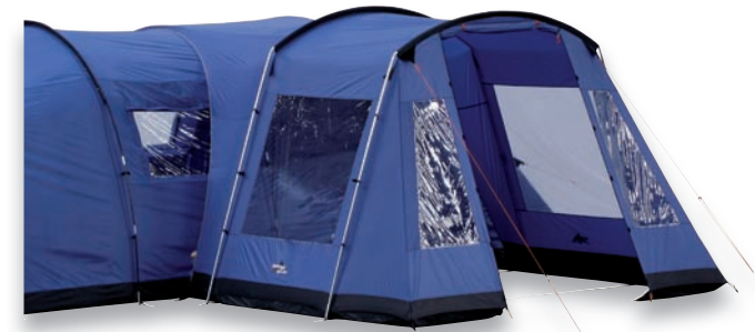
Side Enclosed Canopy True Navy TEFCANOPY T9ATFQ / Moss TEFCANOPY T9BTFQ