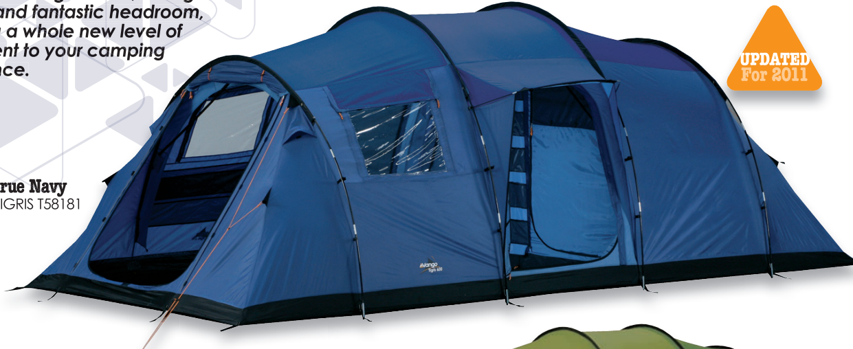
True Navy TEFTIGRIS T58181

Fabrics: Flysheet: Protex® 4000 polyester embossed