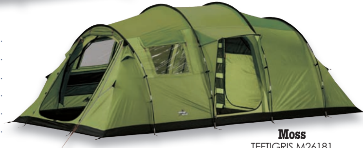
Moss TEFTIGRIS M26181