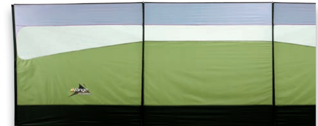
4-Pole Windbreak True Navy TEFWINDBR T49TAC Moss TEFWINDBR M3FTAC